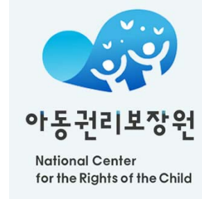
NCRC Korean Adoption Services