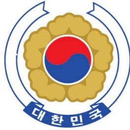
Consulate General of the Republic of Korea